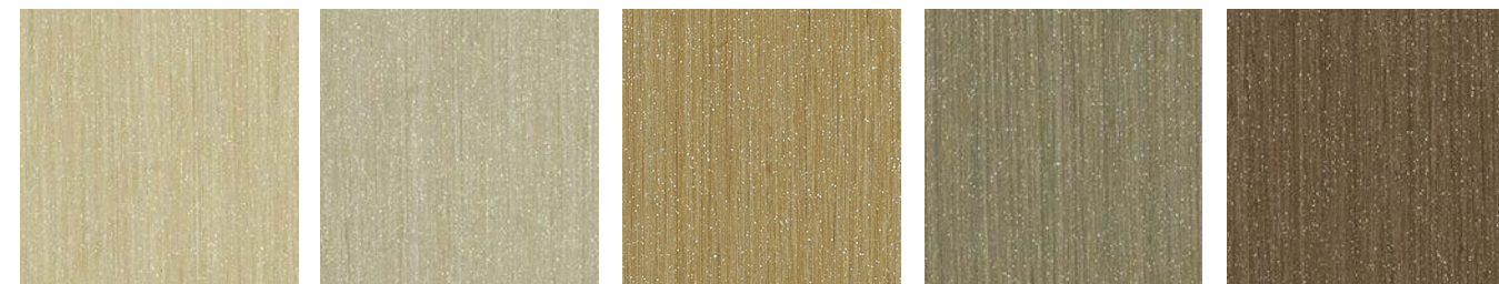
DN2-AST-16 Pecorino DN2-AST-17 Fallow DN2-AST-18 Final Straw DN2-AST-19 Olivine DN2-AST-20 Arrowhead