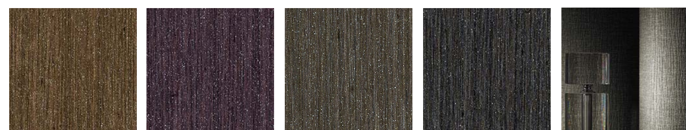
DN2-AST-21 Hazelnut DN2-AST-22 Brunello DN2-AST-23 Peppercorn DN2-AST-24 Black Iron FOR SIMILAR TEXTURES CLICK HERE

Type II 20 oz | Width: 52"/54" | Backing: Non-Woven | Match: Random Match Reversible Pattern Repeat 26"H x 24"V | Fire Rating: Class A | Flame Spread: 10 | Smoke Development: 10