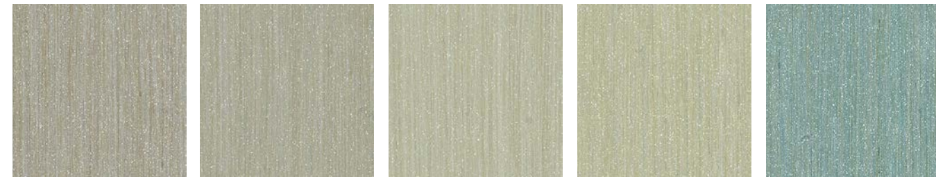
DN2-AST-06 Urban Putty DN2-AST-07 Dovecoat DN2-AST-08 Canyon Cloud DN2-AST-09 Mint Sorbet DN2-AST-10 Sail Away