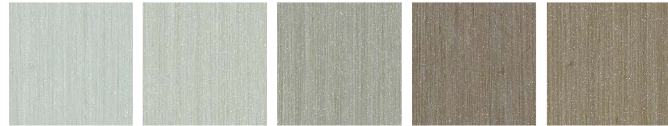
DN2-AST-01 White Frost DN2-AST-02 Dockside DN2-AST-03 Grey Ombre DN2-AST-04 Abby Stone DN2-AST-05 Silt